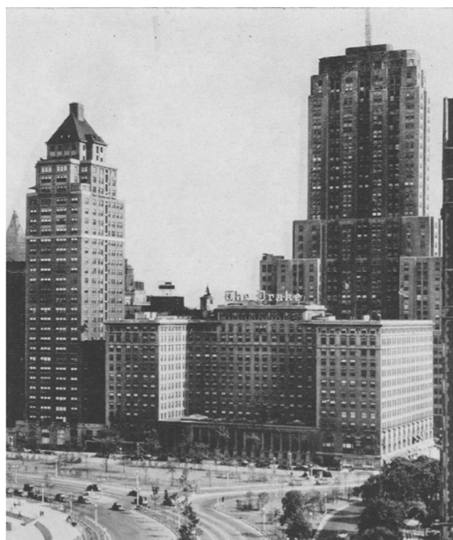
Drake Hotel, Chicago, Ill.

The American Oil Chemists' Society extends a cordial welcome to all.